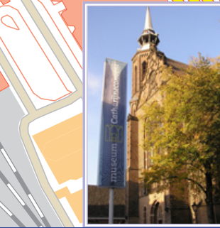
Museum Catharijne Convent (M) Lange Nieuwstraat 38 3512 PH