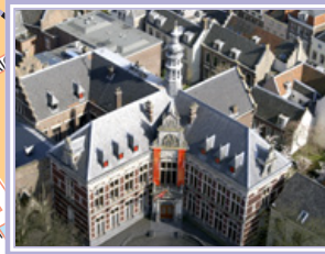
Academiegebouw (A) Domplein 29 3512 JE