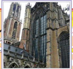
Domkerk (D) Domplein 3512 JN