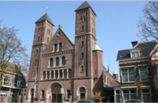
Kathedraal Ste Gertrudis en zalen centrum In de Driehoek (G) Willemsplantsoen 2, 3511 LA